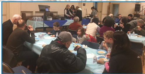
Thank you to Star of the Sea elementary school and preschool volunteers for preparing the soups last Friday!

Friday's Lent Soup Suppers Auditorium 6pm Stations of the Cross 7pm in the church.