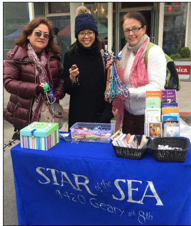
Our Evangelization Team at the Clement Street Farmer’s Market

some because they have disciplined their wills with fasting and penance. The prayerful silence within our church and the warm fellowship within our parish are lovely. We are a school of prayer and service. Spreading the Faith But keeping the faith to ourselves does not get us into heaven. Christ commanded us to spread His Gospel. Comparatively few of us have taken the next step in discipleship, which is to give the grace and truth that we have