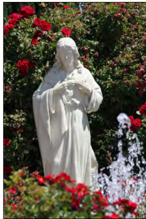
Statue of the Sacred Heart in my last parish

Angel of Portugal taught the children this prayer, which we will pray on June 12: O Most Holy Trinity, Father, Son and Holy Spirit, I adore Thee profoundly. I offer Thee the most precious Body, Blood, Soul and Divinity of Jesus Christ present in all the tabernacles of the world, in reparation for the outrages, sacrileges and indifferences by which He is offended. By the infinite merits of the Sacred Heart of Jesus and the Immaculate Heart of Mary I beg the conversion of poor sinners.