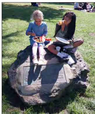
250 Years: our Mountain Lake Mass (and picnic) last Saturday on the spot priests in the Anza Party offered the first Catholic Mass in San Francisco