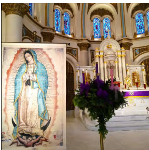
The traveling Guadalupe Tilma, touched to the original in Mexico, in our church for veneration after the noon Mass on Tuesday