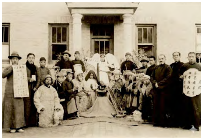
Live Nativity scene, China, 1940s.

David. John the Baptist serves as a bridge between the second and third week of Advent. Over the centuries, the last weeks of Advent have taken on a festive and participative aspect. In 1223, St. Francis, after returning from the Holy Land, recreated a Nativity scene with live animals in a cave as a way of inviting the people of Greccio, Italy, to contemplate more deeply the humility and poverty of the Savior at his birth. In other