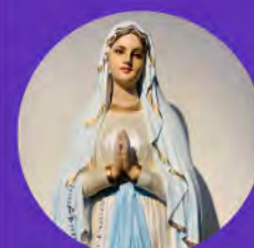
Our Lady of Lourdes