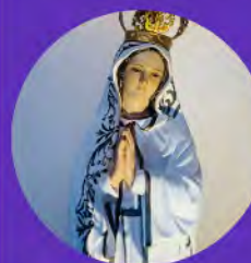
Our Lady of Fatima