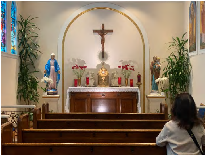
The St. Joseph Adoration Chapel is open all night for Eucharistic Adoration.

In the gospel this Sunday we also hear and are given the example of "You shall love your neighbor as yourself" in the parable of the Good Samaritan. I have also seen the care for the poor at Star as the doorbell rings at the rectory and one meets a homeless person seeking food. The staff generously takes the time to