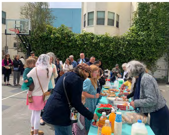
The Adoration Committee providing last Sunday's hospitality after the 9:30 and 11:30 Masses