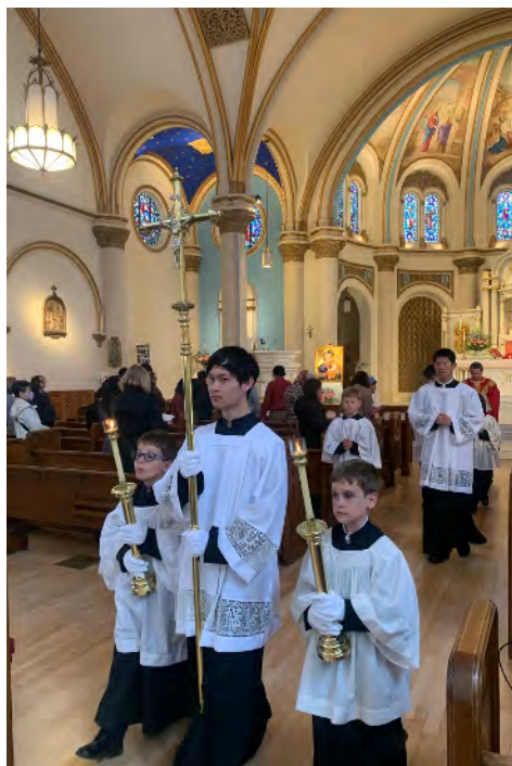
Reverently gaining experience in service.

While the warm strains of the recessional hymn's "Amen" are still fresh in your ear, a little quiet time for that to echo in your heart before the Blessed Sacrament in our adoration chapel can be sublime and spiritually fruitful.