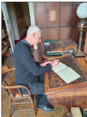
Putting my name in the guest book, along with that of Pope Benedict and King Charles, at St. John Henry Newman's writing desk in the Birmingham Oratory; My car fallen in a hidden ditch (having pulled onto the "shoulder" to let a tractor pass);

Sabbatical Report Many have asked me how my summer sabbatical in Ireland went along, and I am grateful to have completed the writing of my two books. Here are some pictures from that blessed time in rural Cork: