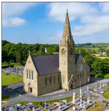
My little "sabbatical parish," Immaculate Conception in the village Enniskeane; My red bike at a wayside Lourdes shrine;