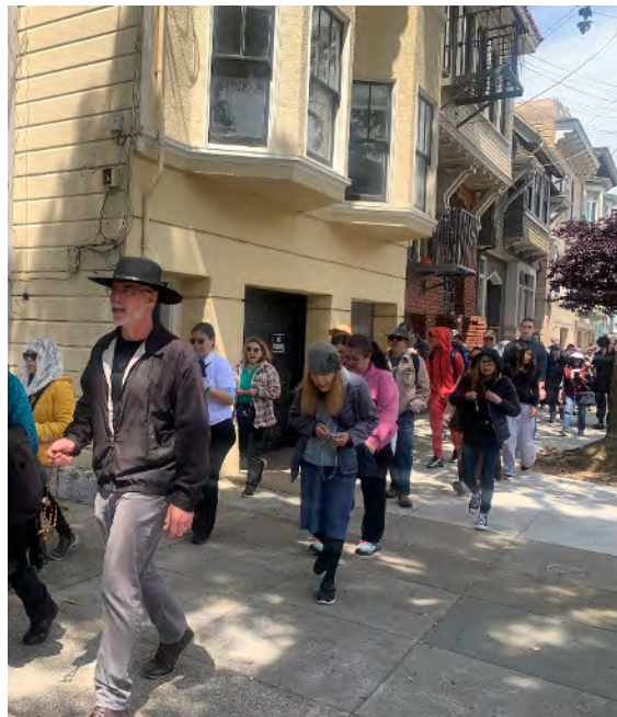
Star of the Sea friends praying a communal Holy Rosary on The Walk to Mary in May 2025.