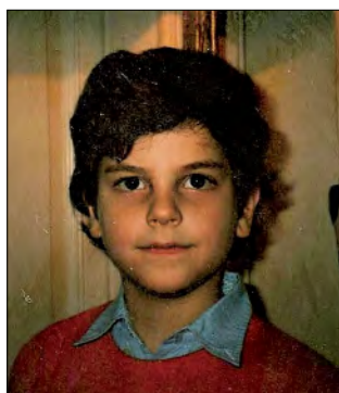
Carlo Acutis as a boy, and as a young man from a prayer card

Carlo Acutis A few weeks ago a young software engineer gave me two biographies on Carlo Acutis, an Italian computer programmer who died at the age of 15 in 2006. So many miracles so quickly were granted through Carlo's intercession that he was beatified within 14 years of his death. God gave Carlo extraordinary understanding for one so young, as well as extraordinary virtues. In particular, Jesus gave Carlo a profound understanding of the Holy Eucharist, and he burned with zeal to share the Eucharist with the world. He developed a website on the Eucharistic miracles which I encourage you to visit, www.miracolieucaaristici.org (the website has been translated into good English and 18 other languages).