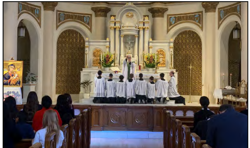
Stella Maris Academy First school year Mass. 7 students served at the Mass.