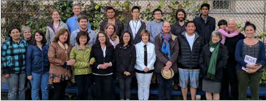
Our largest RCIA class, in 2017