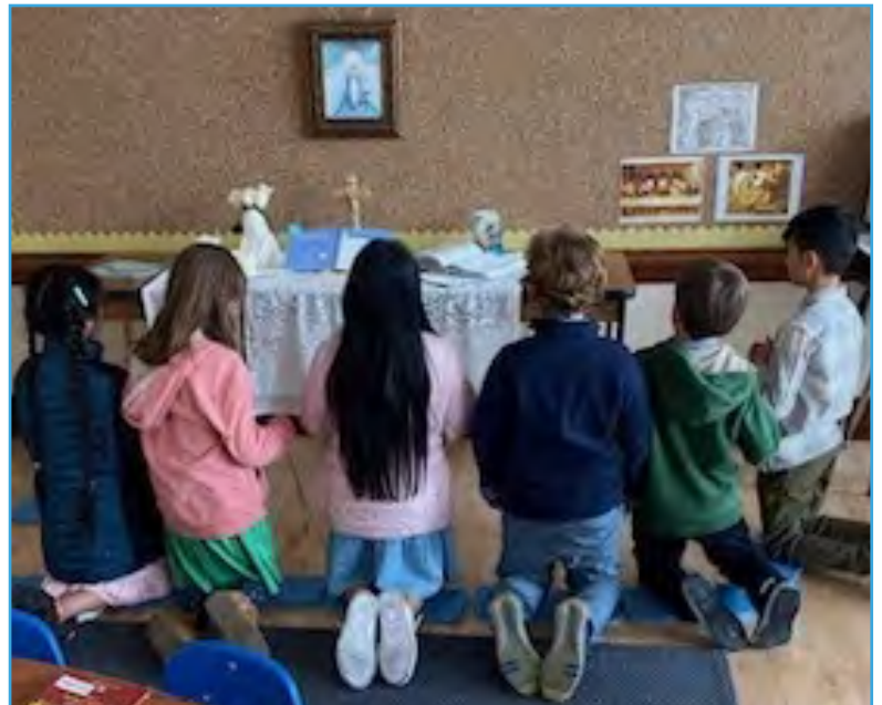
Sunday's Catechism Class. Children praying the Rosary.

info@bellaprimarycare.org | bellaprimarycare.org