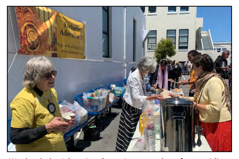
We thank the Adoration Committee members for providing warm coffee and pastries and lots of smiles last Sunday.

info@bellaprimarycare.org | bellaprimarycare.org