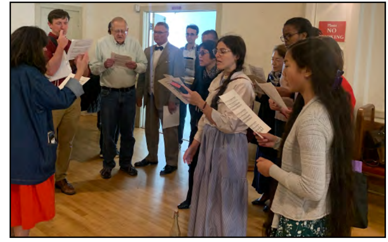
We thank all who attended the joyful potluck luncheon to celebrate our parish priests ordination anniversaries!