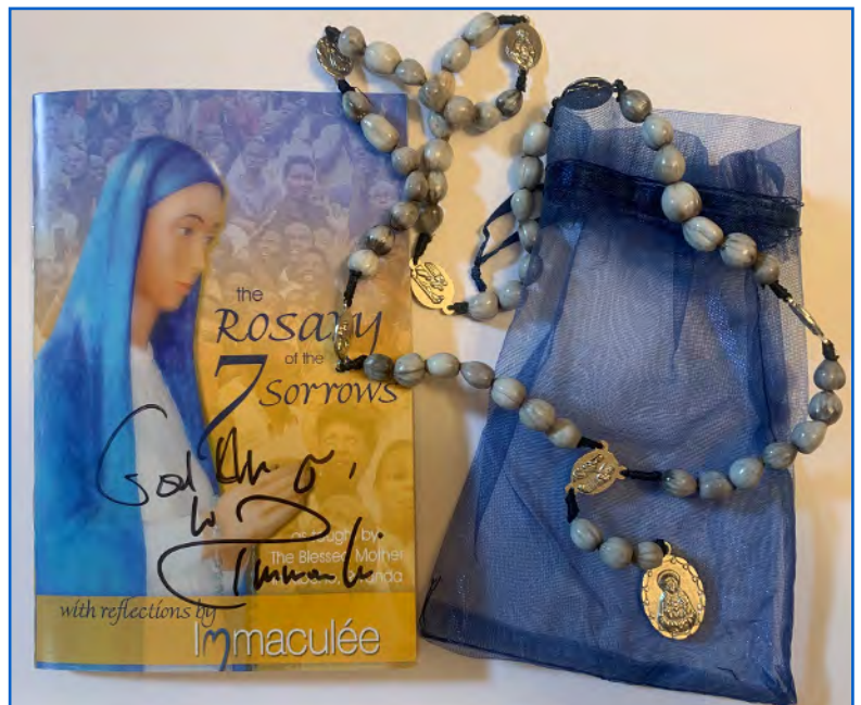
Seven Sorrows Rosary handmade in Rwanda using the "seeds of the flower Tears of Job" and The Rosary of the 7 Sorrows booklet signed by Immaculee Ilibagiza, both available in the parish office for $25.

dumaryc@gmail.com | www.foundationforpriests.org Star of the Sea Church, 4420 Geary Blvd, San Francisco