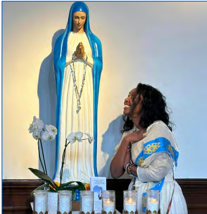
Immaculee Ilibagiza visited our parish last Saturday after a nice retreat presented at St. Dominic church. Immaculee gifted her 7 sorrows Rosary to our Lady of Kibeho and asked us to please pray the Rosary daily!