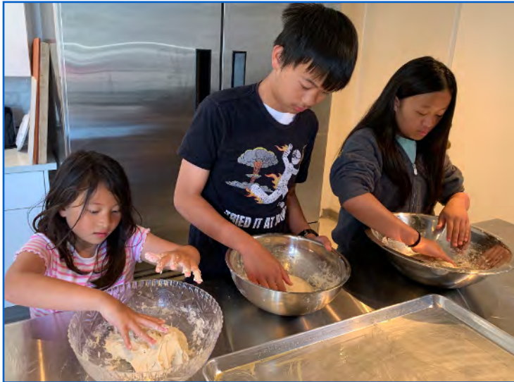
The Stella Maris Academy Summer Program children, enjoying a cooking lesson making fresh focaccia bread!