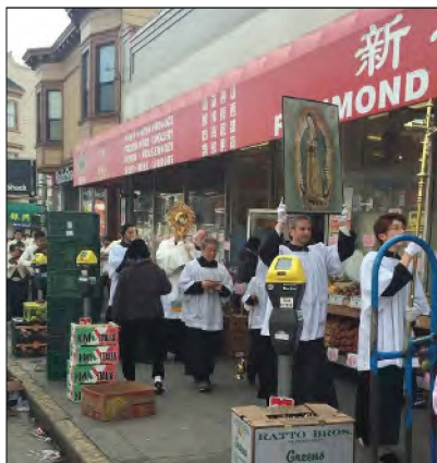
Parish Procession in 2014