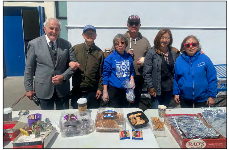
We thank you our FAASTAR friends for providing warm coffee and a variety of treats at the Sunday Hospitality!