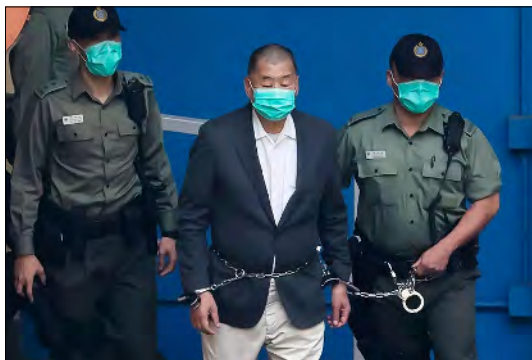
Jimmy Lai on his way to prison in 2020.