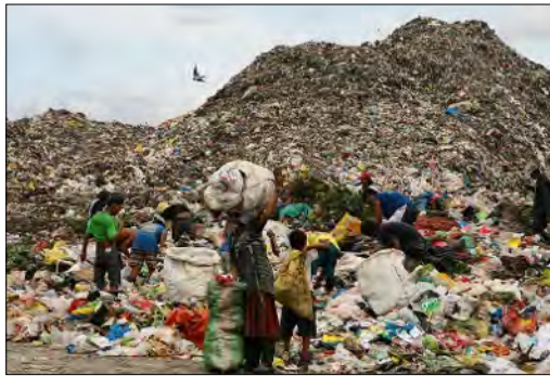
Children raggicking through the Inayawan garbage dump