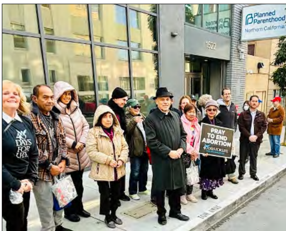
The Archbishop praying with our parishioners at the abortion facility last week