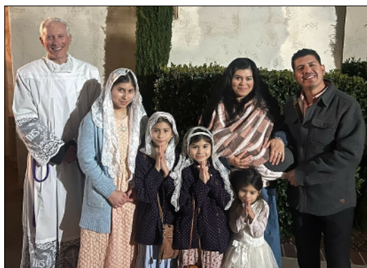
Some of our parish men at the men's conference last week; our St. Joseph's Table last year; and a family at Holy Innocents Parish during my Lenten Mission last week

March 25 and March 28. For now, though, our statues and crucifix have been covered with purple veils. In the traditional Gospel for the Fifth Sunday of Lent, Our Lord goes into hiding two weeks before Passover. And so his saints and angels go into hiding with Him, preparing us for the terrifying death of God that we will live through, once again, on Good Friday.