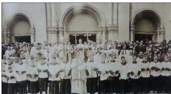
Consecration of our new church in 1914; Dedication of Star of the Sea School in 1909

speak on the ways our community is serving the needs of the poor in San Francisco today. I encourage you to support our parish and school of 2024 by purchasing a seat, or even a whole table, at our annual Gala (tickets are $150). 75% of our students receive tuition assistance, and they are well worth the expense. Come to our Gala on January 27 to support them, and to rejoice during this Catholic Schools Month in the gift of Catholic education!