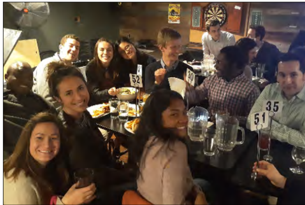
Our Young Adults in 2019. Most of them are engaged or married by now!