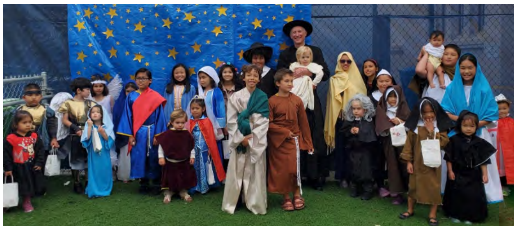
Some of our littler Holy Ones at our All Hallows festival in 2021