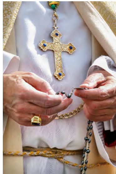
The Archbishop praying at last year's Rosary Rally, downtown