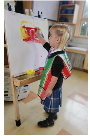
The preschoolers enjoying a sunny day playing in the sandbox. In the classroom the children are daily exposed to a variety of art mediums (in the picture a child is painting with tempera).