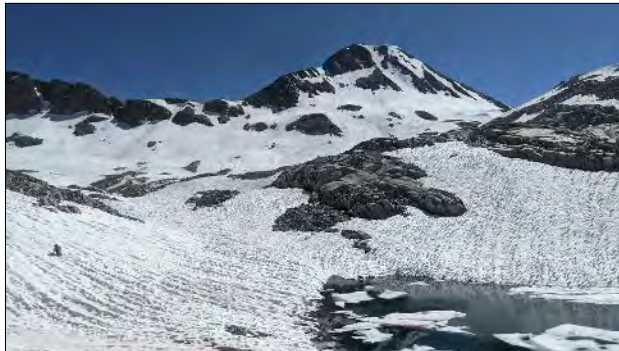
One of our party (just a speck on the left!) working through a mile of deep snow below Muir Pass