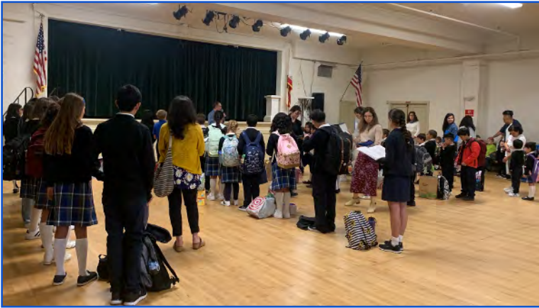
We welcome the Stella Maris Academy and Star of the Sea Preschool children who are back to school for the school year 2023-2024. Please keep our parochial school families and teachers in your prayers.