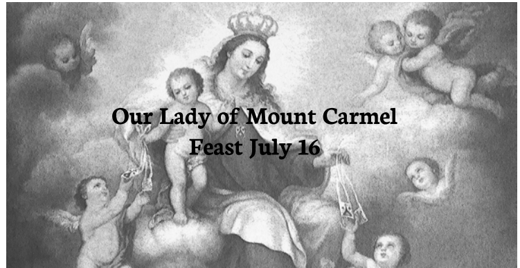
Our Lady of Mount Carmel Feast July 16

Note: Brown Scapulars handmade by the Carmelite Sisters of the Cristo Rey Monastery are for sale in our church kiosk, $5.00 each