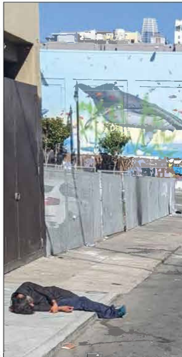
A man who was given all the fentanyl he desired on the streets of San Francisco