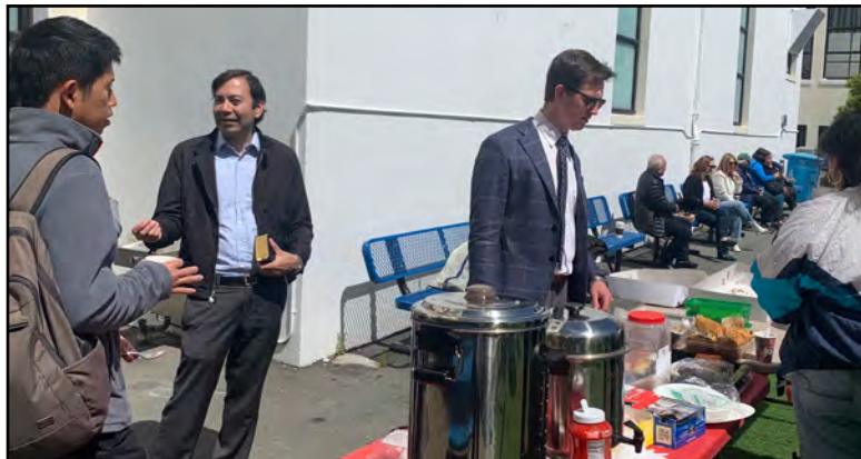
Special thanks to our faithful volunteers! The Young Adults provided warm coffee and lots of smiles! and The Foundation of Prayers for Priests coordinators (bottom picture) managed their information table, on a windy Sunday in San Francisco!