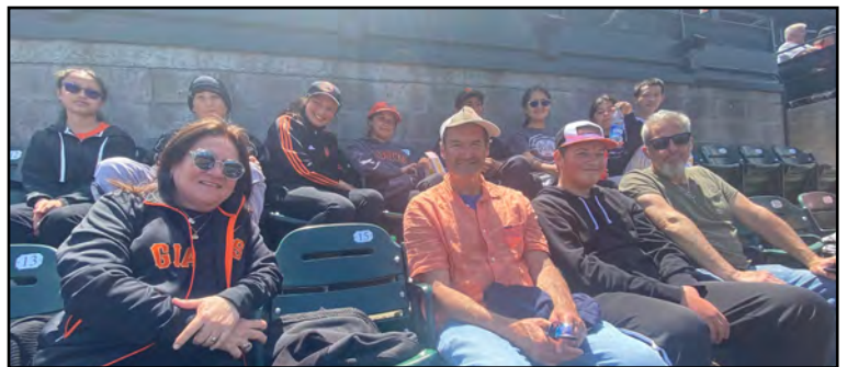
The 7th and 8th grade Stella Maris Academy students enjoyed a nice field trip to watch a baseball game at the Oracle Park in San Francisco last week.

An information table will be available at the school yard next Sunday June 18