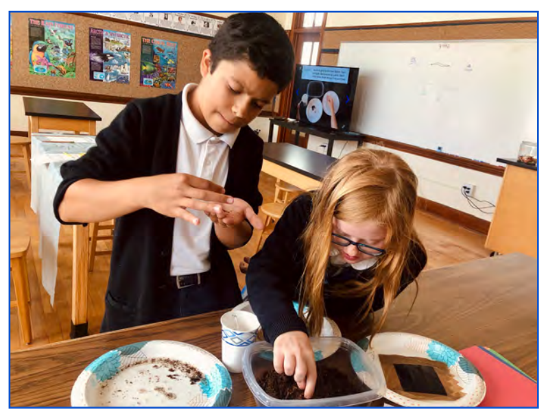
After a discussion on God's great design in the harmony of nature, fourth grade students explored how worms help decompose decaying matter.