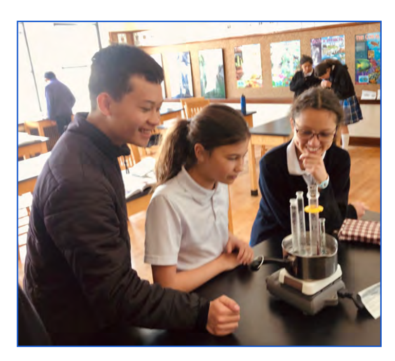
In the science lab, seventh and eighth grade biology students investigated the effects of the saliva enzyme "amylase", as it broke down cooked rice.

order that can be found in the creation of our world."