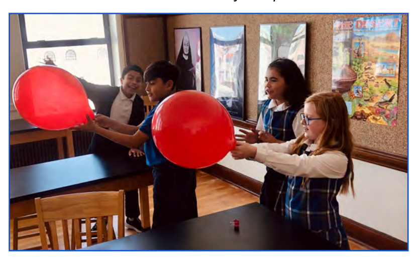
Students discovered that sound travels through the air by making vibrations. What would happen if you screamed in outer space? Absolutely nothing.