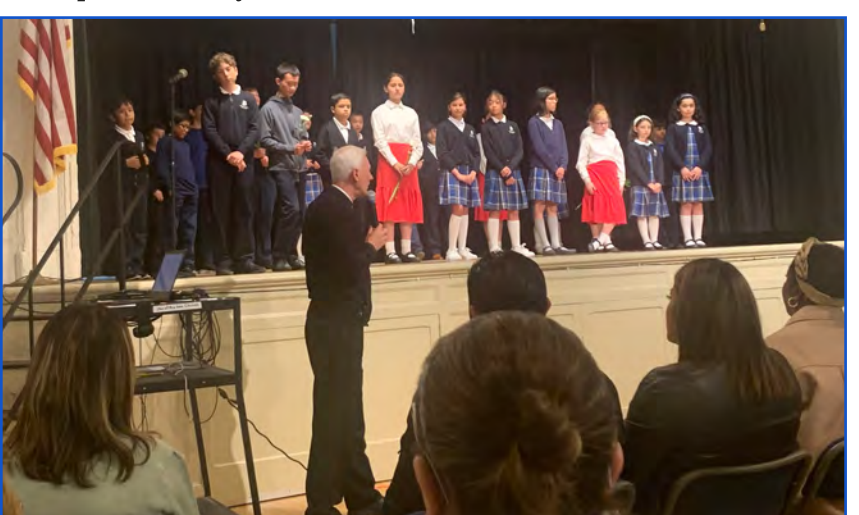
Our first Stella Maris Academy Sängerkrieg was a joyful and well attended spring concert. The children delighted the audience with a nice selection of songs, dances and poetry.