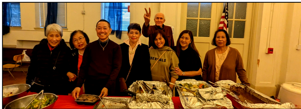
Thank you to the FAASTAR members for the lively Flores de Mayo dinner celebration last Saturday.