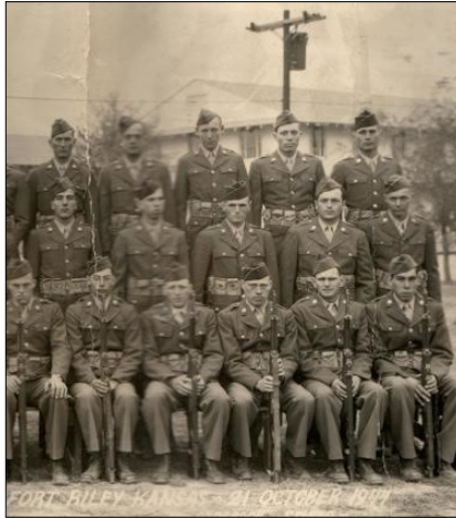
My dad's regiment in 1944

Pentecost This Sunday's feast is the third most important of the year, after Easter and Christmas. We live in the age of the Holy Spirit, and today's mystery (the Third Glorious Mystery of the Holy Rosary) reveals the Church's birth in the Upper Room, the same place where Jesus offered the First Eucharist. The building shook, a great wind filled the place, and flames of fire descended upon the nascent Church. We are descendants of those apostles, gathered around Our Lady, and we too have received the Holy Spirit. Never forget your dignity, dear people, as bearers of the Eternal Word and the Fire of God's infinite love. We are blessed, in our parish, to be able to