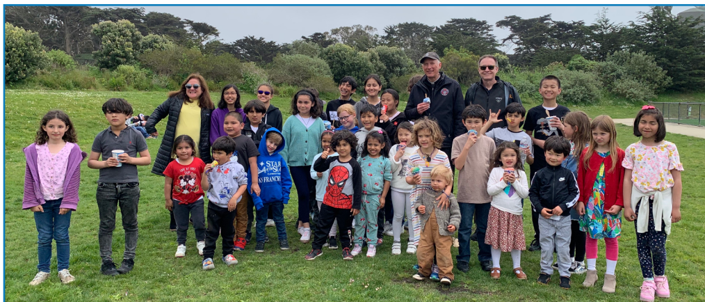
Stella Maris Academy End of the Year Family BBQ at the Golden Gate Park Beach Chalet Picnic Grounds.