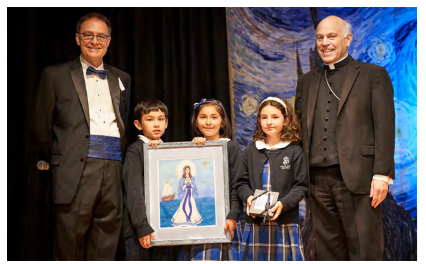
Archbishop Cordileone is presented with a gift from the SMA students.