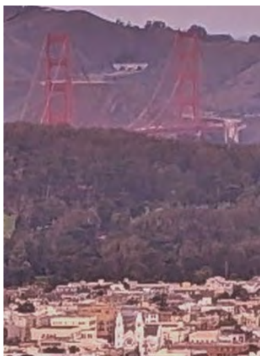
I took this picture from Mount Sutro -- our church towers within the Golden Gate Bridge Towers!

Silence I give up media for Lent, as much as I can and still do my work. The first few days of silence is the hardest; I wake up looking forward to a podcast, and instinctively reach for the radio to hear some music if nothing else is happening. I woke up on Ash Wednesday dreading the self-imposed emptiness. Usually I wash up in the morning to the sounds of either Mozart or a stimulating podcast, but for the next 40 days I will shave in silence; I will do my morning stretches in the still emptiness of a city before dawn. I will listen only to the Word of God before going downstairs and watch nothing more than the light quietly rising from the east. Fasting from food is essential, but fasting from noise is no less essential. Giving up sweets heals our bodies, but giving up noise heals our souls. Silence of the ears, silence of the eyes, silence of the touch: this purifies our souls