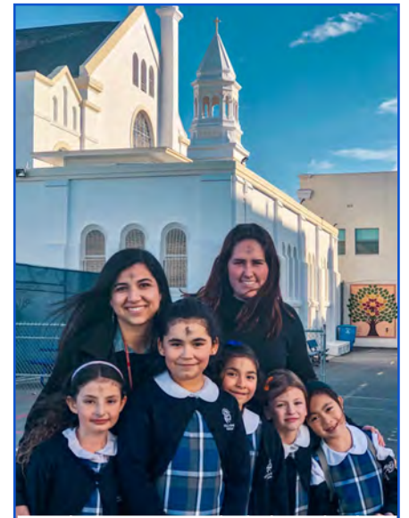
Ash Wednesday is a day to be cheerful.