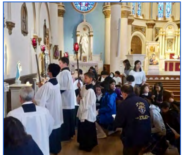
Students and teachers pray the Stations of the Cross during Lent.