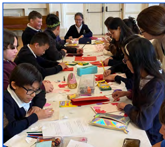
Students crafting St. Valentine's Day Cards for St. Anne's Home in the Richmond District.