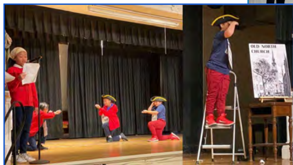
Grade 5-6 students perform a dramatic recitation of "Paul Revere's Ride" at Morning Assembly.