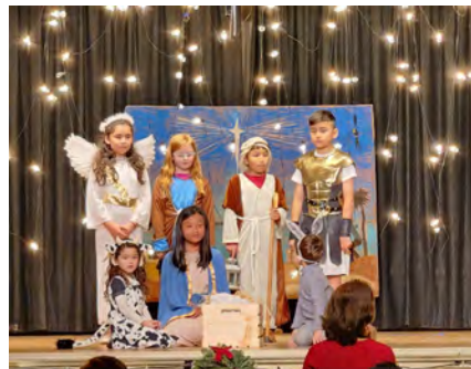
Top to Bottom: Christmas pageant 2022, hike in the Redwoods, exploring the Presidio