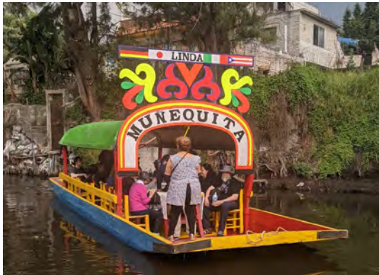
Pilgrimage Pictures: a boat ride at Xochimilco, and praying at Blessed Miguel Pro's tomb, Mexico City