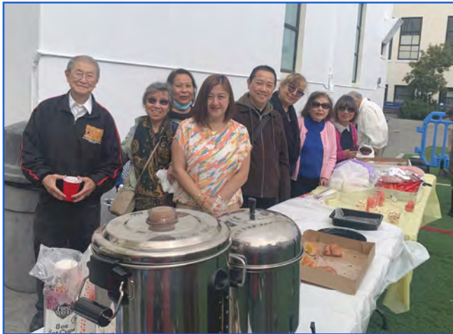
We thank our FAASTAR (Filipino American Association) ministry for providing coffee, donuts and lots of smiles last Sunday!