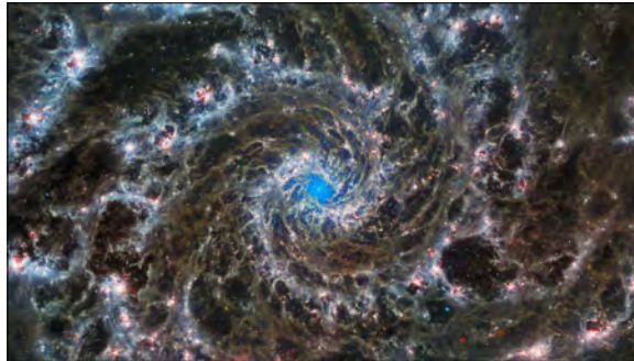
The James Webb image of the Phantom Galaxy

undetectable by empirical instrumentation. You can't weigh them, see them, or sense them in any material way unless they take on a physical appearance for some good reason. The number of angels far exceeds the number of human beings that have ever lived, and each angel is