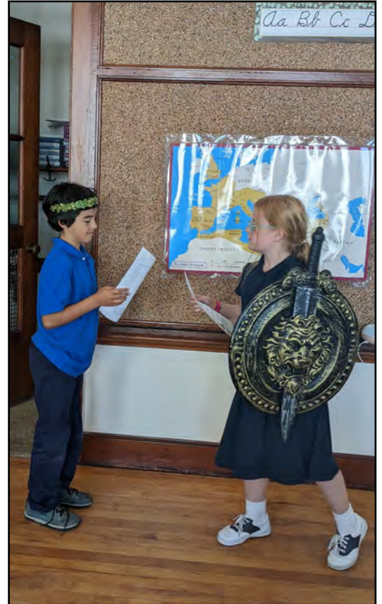
Grades 3-4 practicing introducing themselves to citizens of another province of the Roman Empire!