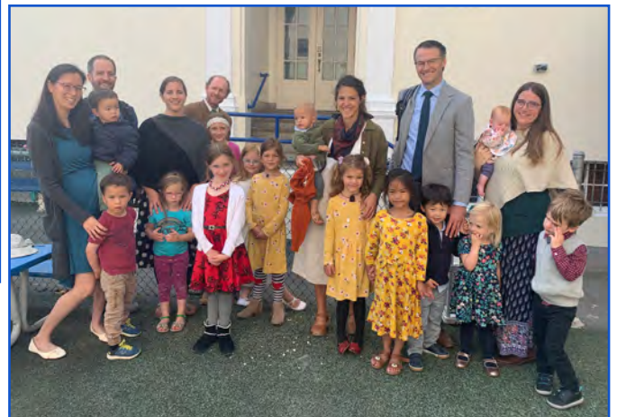
Join our Marriage and Family Apostolate Register in Flocknote.com/star