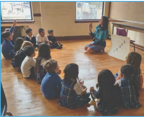
The K-2 music class, singing to prepare for the chants of the school Mass.