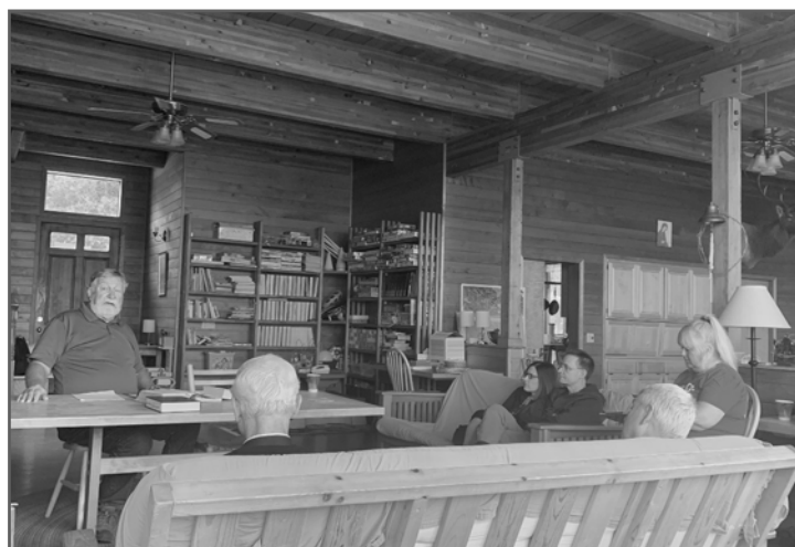
Parish staff and Stella Maris Academy teachers at Sweetwater retreat house last weekend