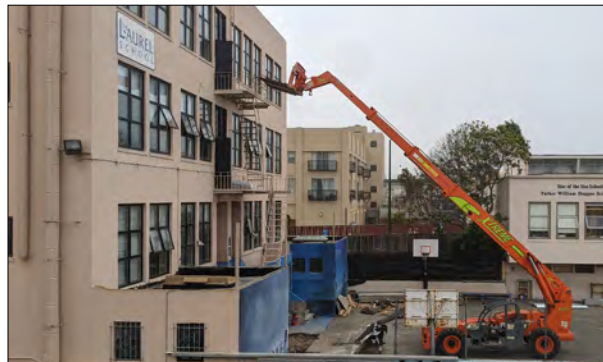
Retrofitting our high school building