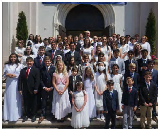
Our Confirmation Class this year