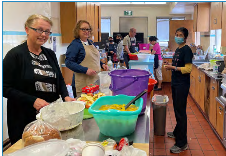
Thank you to our volunteers for serving the homeless weekly.