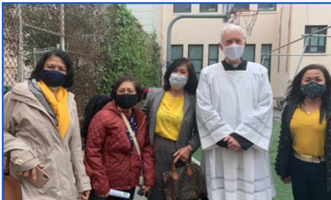
Congratulations to "El Shaddai Group" for their 29th Anniversary of establishing as a prayer group in San Francisco, and 17 years at Star of the Sea.