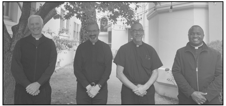
STAR OF THE SEA CLERGY