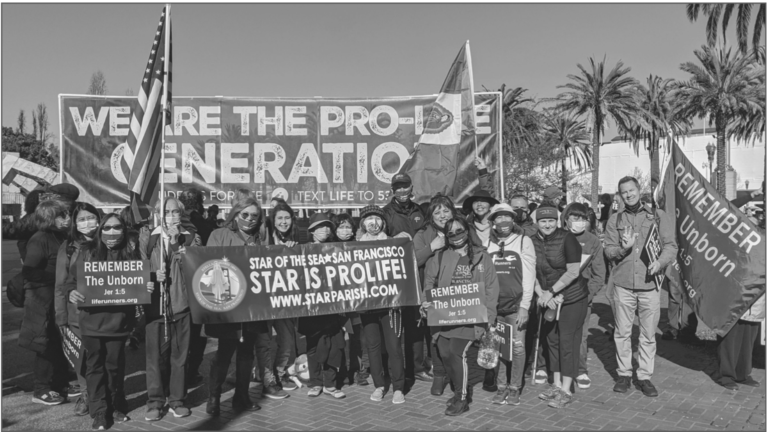
A group of Star of the Sea friends at the Embarcadero after the Walk for Life!