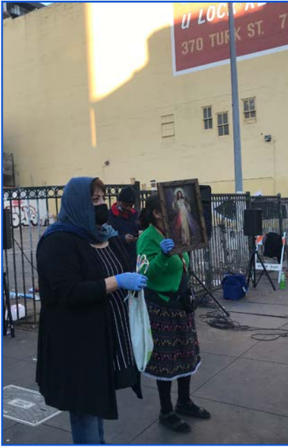
Some members of our Guadalupanas ministry on the streets of San Francisco, praying and feeding the homeless. We are thankful for their commitment to feed the homeless every Sunday.