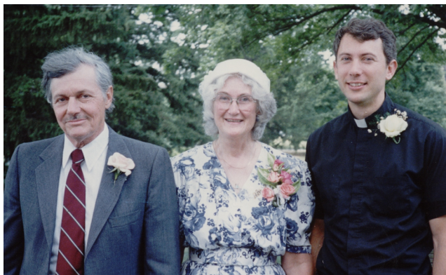
Mom, Dad, and me after my First Mass

Our Blessed Mother About a month ago, someone walked off with the statue of Our Lady that has graced the front office door. About three years ago, an unhappy person pushed our last statue down the steps, and within a week someone else had replaced the shattered statue. Now that statue has walked off, so if anyone has a closet full of 3-foot statues of Our Lady of Grace ... we need another one. And speaking