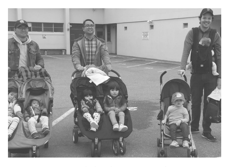
Dads babysitting for the Mother's Group

During the Triduum (Thursday, Friday and Saturday of Holy Week), there will be no 7:30am or 12 noon Mass. Instead there will be Tenebrae, a special morning prayer for the holiest week of the year!