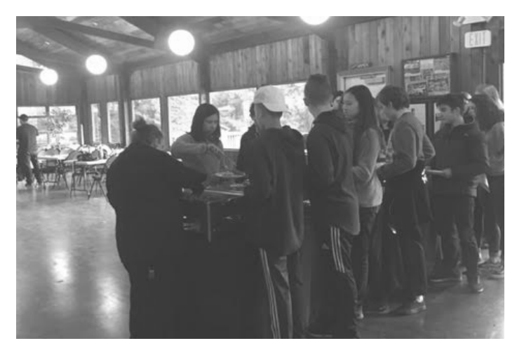
Star of the Sea 8th grade retreat

Do you feel alone? Are you frustrated or angry with your spouse? Does talking leads to arguing? Or have you just stopped talking? Retrouvaille (pronounced retro-vi with a long i) helps couples through rough times in their marriages. Tens of thousands of couples have benefited from this program. For confidential information about or to register for the April program on the weekend of April 13-15, call (415) 893-1005 or email: SF@RetroCA.com or visit the web site at <a href="https://www.HelpOurMarriage.com">www.HelpOurMarriage.com</a>