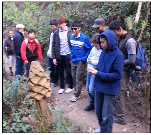
Altar server hiking trip on Mt. Sutro last month

niversary of Perpetual Adoration at the parish, all three priests will offer a Solemn High Mass at 6:30pm. We will unveil a chapel plaque with names of our major benefactors and enjoy a "St. Joseph's Table" after Mass. Hope you can join us.