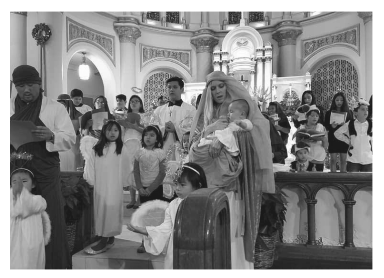
PSR Christmas Pageant