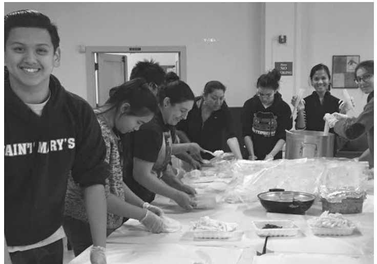
Making Tamales, the Advent tradition of Las Posadas