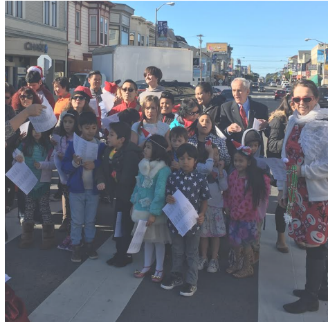
Caroling at the Farmers Market