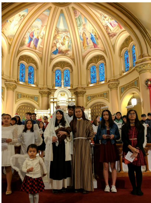
Last year's Christmas Eve Pageant