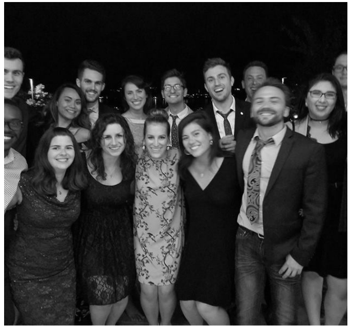
Star Young Adults at the Harvest Ball