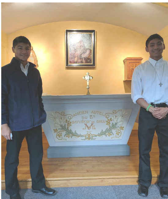
Silmaro Boys with St. John Vianney's Altar

Stewardship of Time I was 21 years old and been attending daily Mass since my first year of college, when a friend invited me to attend a novena at Cristo Rey Carmelite Monastery on Parker and Fulton. For a young adult in San Francisco, just out of college and raring to go, nine evenings spent in prayer was a lot to ask. If it had not been a good friend, and had not Cristo Rey been so beautiful, I don't think I would've gone. The call to a deeper discipleship almost always comes from a friend, not just a pulpit announcement or a pastor's message in your bulletin. Still, I am writing this to prepare the ground. As some point in your life, I hope, if you are not already practicing Christian stewardship of time, you will discover it as a way of life. Stewardship of Time refers to the number of hours a week we give to God in prayer. I was already going to Mass every day, and praying the rosary almost every