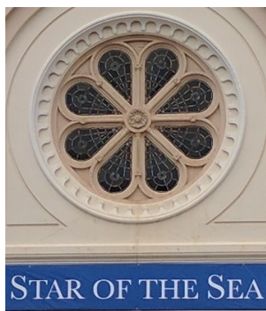
like our new sign?