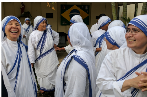
In Brazil after our retreat last month

Papua New Guinea I'm on my way to New Guinea as you read this, to give a 10-day seminar and retreat to the Missionaries of Charity Sisters. (These retreats are my little bit of missionary work each year, and I use vacation time to give them.) Please pray for me, because I am not as strong as I used to be and living conditions are primitive. I always ask the sisters to pray for you, my beloved parish, during their Masses and holy hours. Both retreats I'm giving this year (the other was last month in Brazil) are themed around Our Lady of Fatima, and I encourage you to read a book about Fatima during this centenary of the 1917 apparitions. Her message is truly God's word for our troubled time. Pay particular attention to