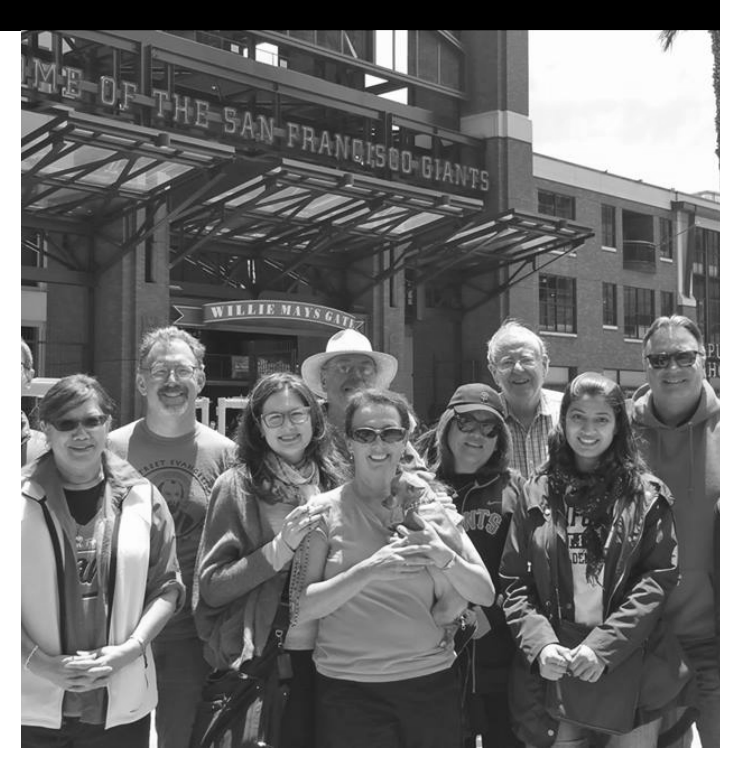
Evangelizing those Giants fans!

Calling all Youth. The Junior Legion of Mary will be meeting on Sundays after the 9:30am Mass. Next meeting is Sunday, July 9th in the school auditorium. Make new friends and make a difference! All youth are invited! Also, please join us for the Mount Davidson Youth Hike on Saturday, July 22nd. Meet at 8:30am Mass. Please bring a sack lunch and your parent permission slips. For more info please call 415-370-7340