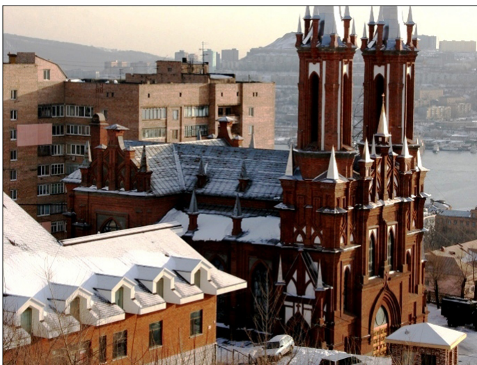
The newly-restored cathedral in Vladivostok