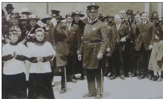
Some historic photographs from our parish on June 3, 1917. The church was rebuilt in 1929.