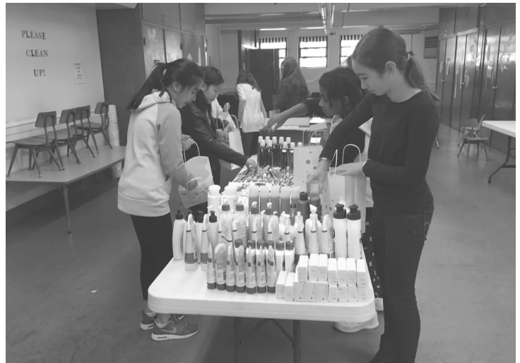
Star Outreach serving the Elderly

Many thanks to all who responded to my call to action last Sunday! We were only at 30% ($23,000) of our $77,000 goal on Sunday, but by Monday morning we jumped to 71% ($55,000). You more than doubled our progress in two days! The red thermometer that Martin put up in the church vestibule will soon burst its top. Remember that 100% of gifts received over $77,000 comes back to our parish, so make your gift today. Join me if you can in the 1% Club by giving $770, or $77 a month. Our gifts fund the Archbishop's work of bringing the Gospel of Jesus Christ to San Francisco, preparing seminarians for ordination, funding our Catholic schools, and feeding the homeless. Be generous!